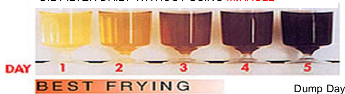
OIL FILTER DAILY WITHOUT USING MIRACLE

works by removing food debris and impurities from your fryer oil which are a major cause of oil breakdown. By using MIRACLE FILTER POWDER daily you can increase the life of your oil by up to 60% which means more profit for you! Your oil will stay cleaner day after day and you will serve maximum quality fried food from your clear odour-free fryer oil