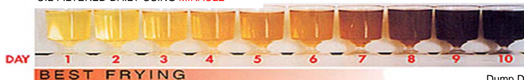
OIL FILTERED DAILY USING MIRACLE